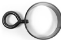
DE8113 driveway collar w/ eye bolt (2-1/2")