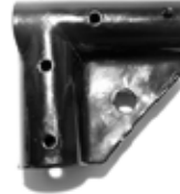
DE8116 metal gate corner (1-5/8" x 1-5/8")