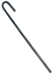
DE2884 18 inch Rebar Ground Stake