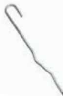
DE2878 12 inch Kinked Ground Stake