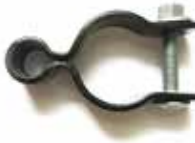
DE8210 female gate hinge (1-3/8")