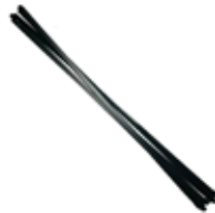
DE2860 Black Stainless Steel 14 inch cable ties