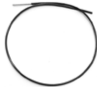
HSC1001-0XXX 8 gauge steel core cable