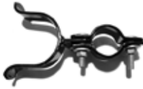
DE8182 driveway gate latch (1-3/8" x 2-1/2")