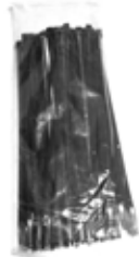
DE2856 Black Heavy Duty 14 inch UV cable ties