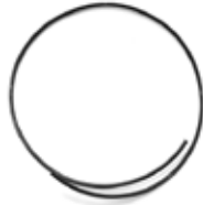
DE2820-0XXX 8 gauge nylon cable