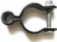
DE8210 female gate hinge (1-5/8")