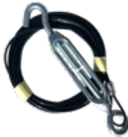
DE8464 access gate turn buckle and leveling cable