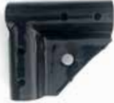
DE8113 metal gate corner (1-3/8" x 1-3/8")