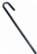
DE2882 12 inch Rebar Ground Stake