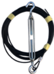
DE8464 driveway gate turn buckle and leveling cable