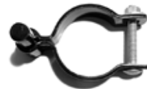
DE8216 male driveway gate hinge (2-1/2")